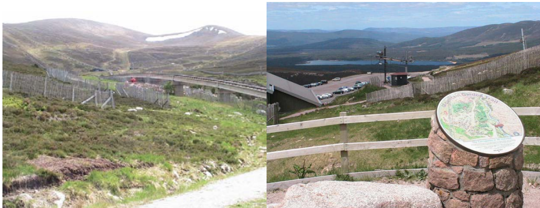
Fig 1 existing path above car park, new path to fork off to left adjacent to funicular. Fig 2 View from mountain garden looking down line of proposed route.